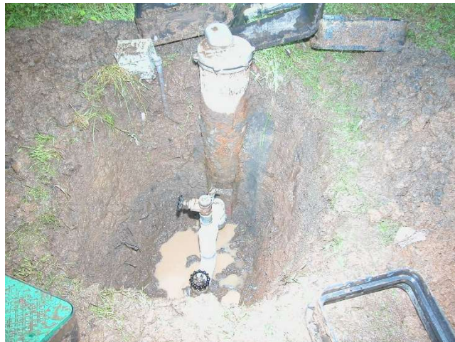
upgrade to pit less adapter