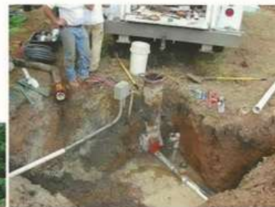
Upgraded well head on old well