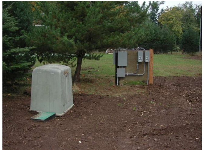
Well head electrical panel